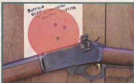
Buffalo Bore's Heavy .35 Remington delivered this group at 50 yards with iron sights.