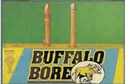
Buffalo Bore's Heavy .35 Remington 220-grain FP and .38-55 Heavy 270-grain hard-cast LFN.

Marlin 336T for several years to no avail. Then one Labor Day weekend I walked into a small gun shop in the little mountain town of Cascade, Idaho, and noticed one on the back shelf. When I asked about it the clerk said, "Oh you don't want that one; it's not a .30-30, it's a .35 Remington." I was most happy to take it off his hands at a bargain price.