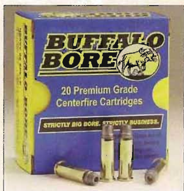
Buffalo Bore Heavy .38 Special

have too much ammo. So with that bit of high-volume philosophy in mind, let's take a look at some of this year's most appealing introductions.