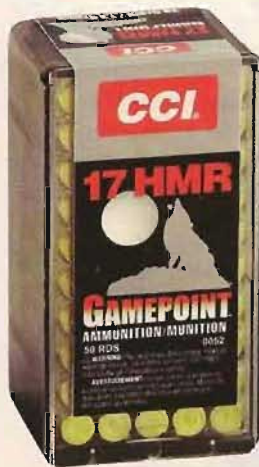
CCI .17 HMR GamePoint

Enhanced lineup: Federal's new centerfire rifle ammo features