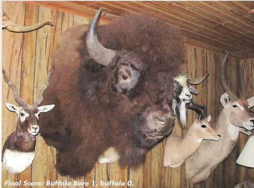
Final Score: Buffalo Bore 1, buffalo 0.

It began with the idea of one more near-perfect packin' pistol, this time in the then-new .480 Ruger.